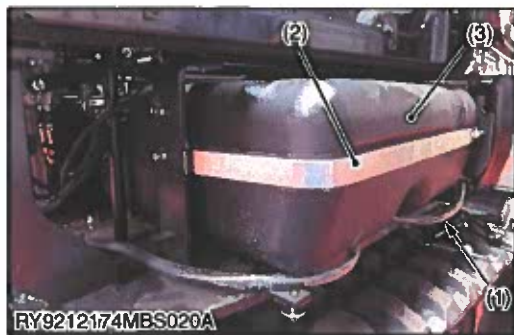
Fuel hose circuit