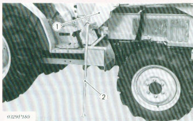
(1) Side Frame