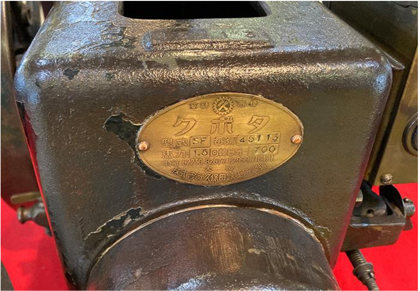
The emblem of the SF-type oil engine