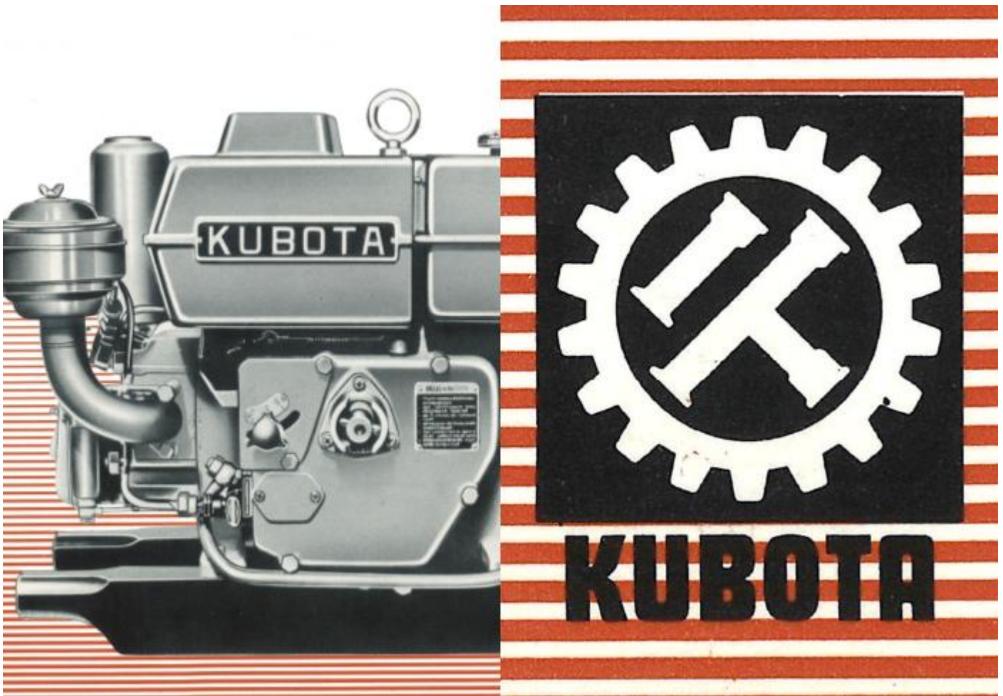
A logo with a pop-art feel evocative of the early 1980s