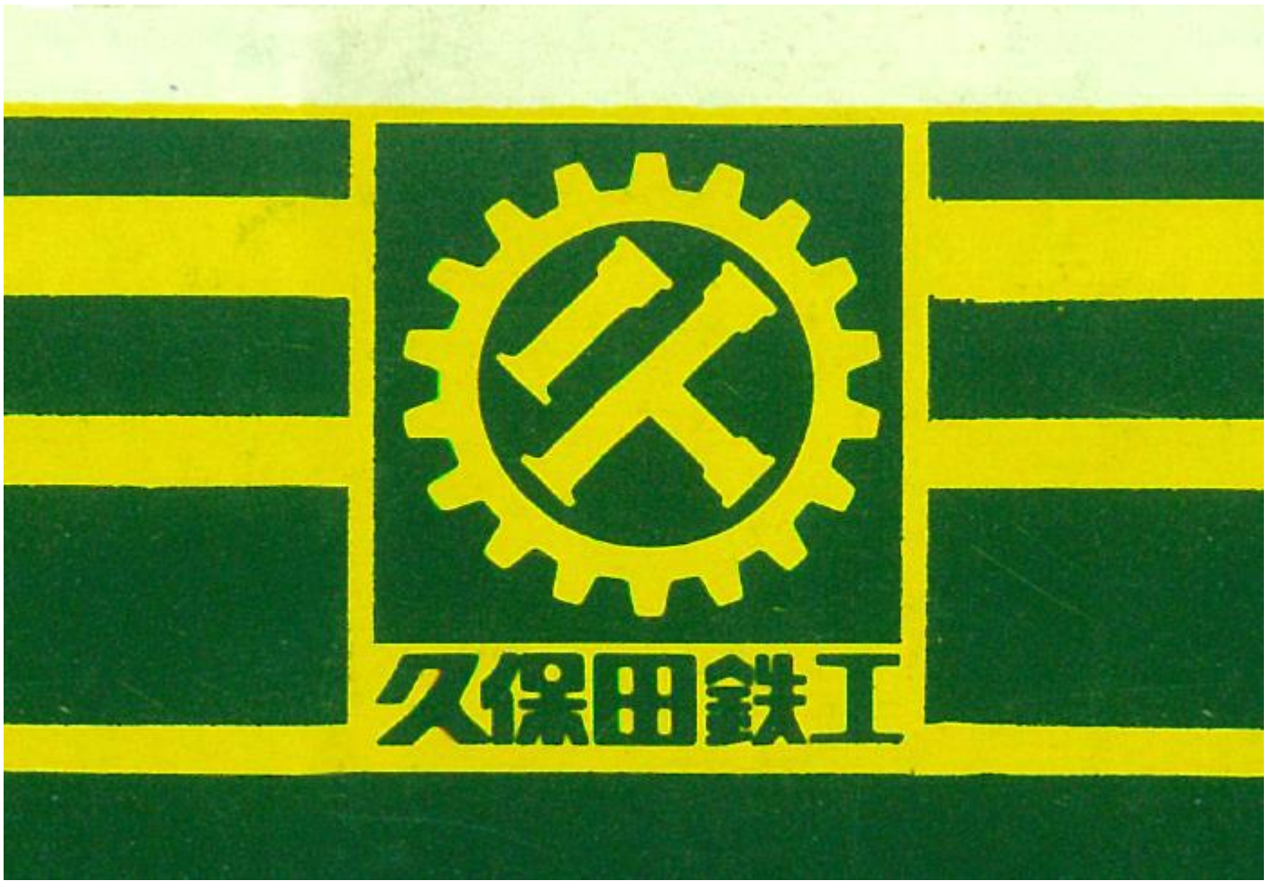
A vivid green and yellow version