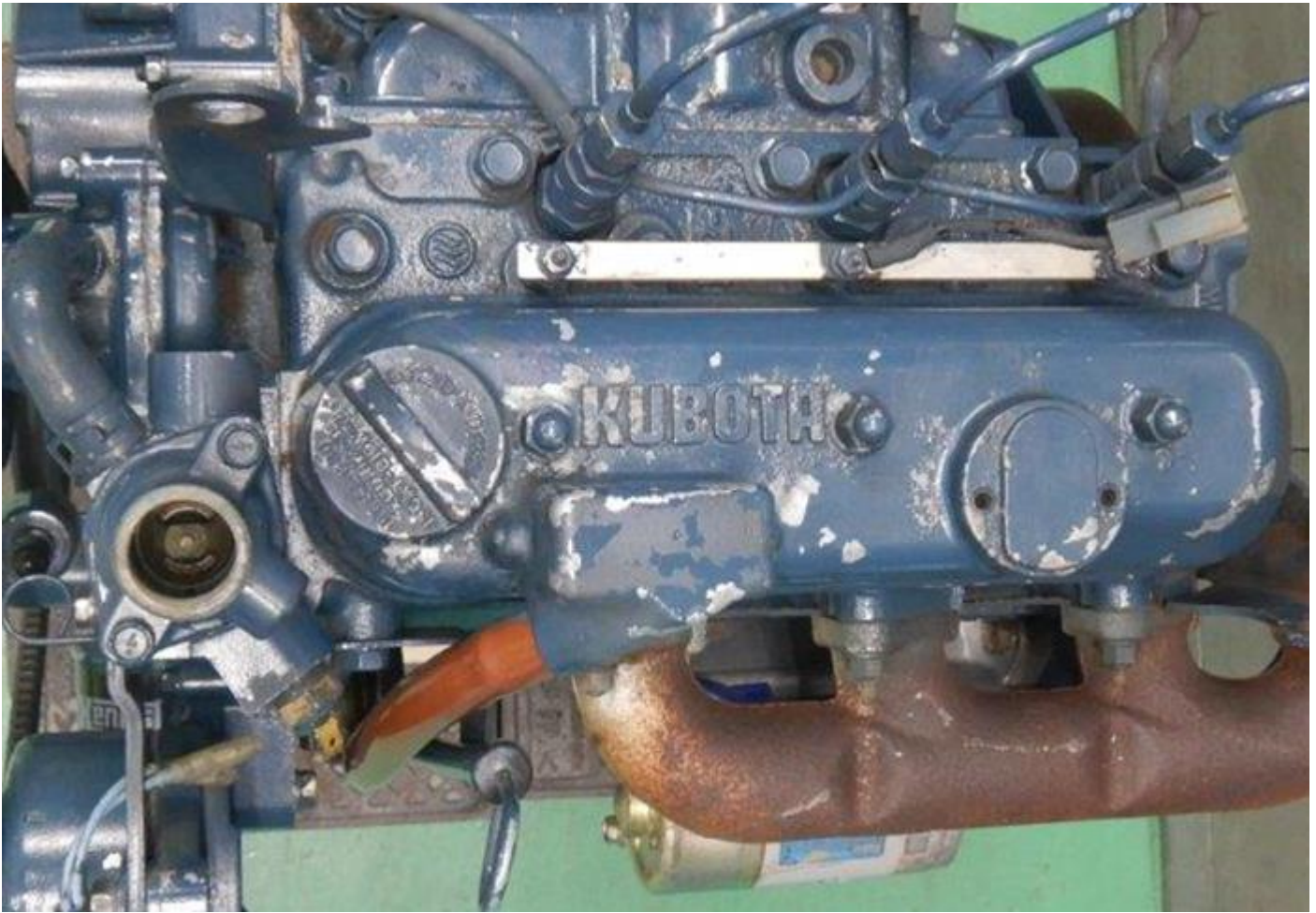
The "KUBOTA" logo on a D905 engine